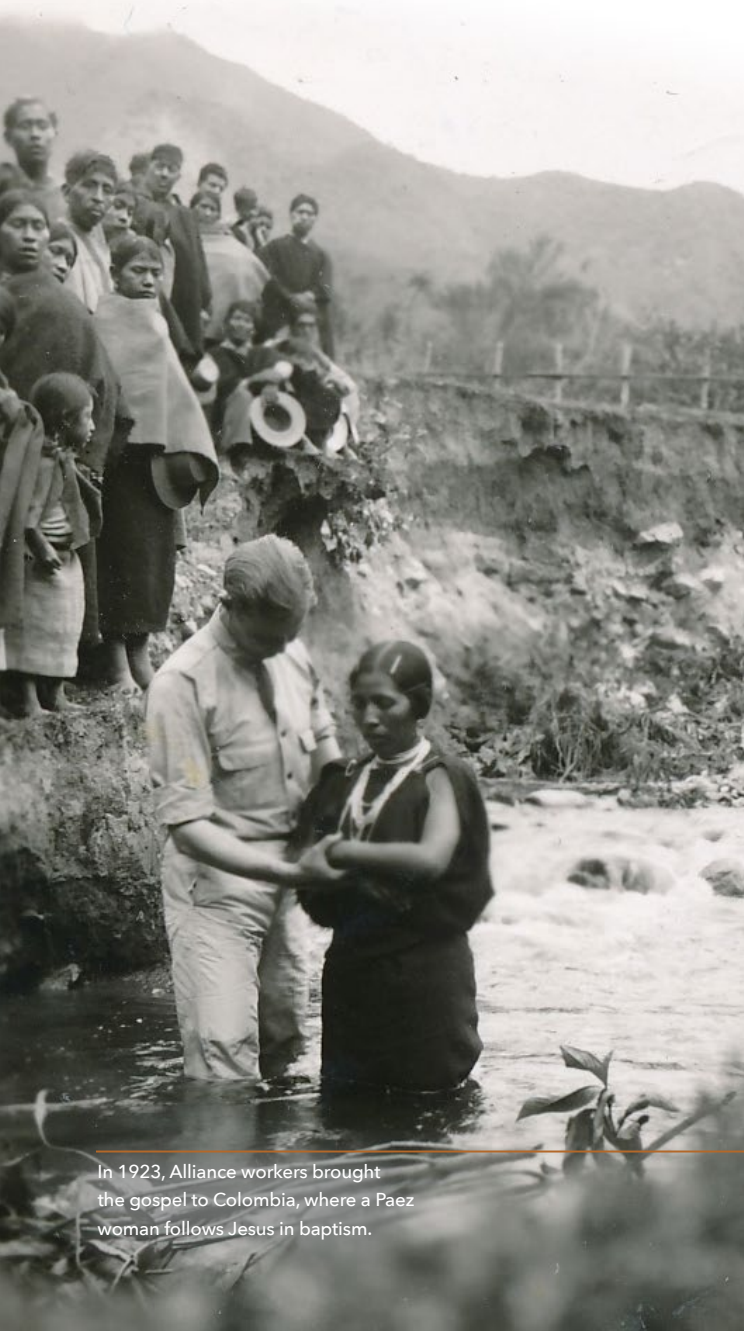
In 1923, Alliance workers brought the gospel to Colombia, where a Paez woman follows Jesus in baptism.

Christian and Missionary Alliance churches encourage all followers of Jesus to be baptized.