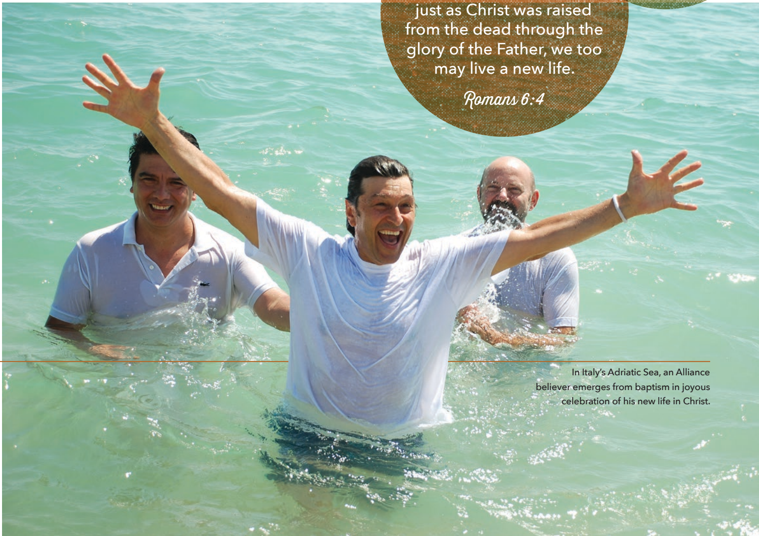
In Italy's Adriatic Sea, an Alliance believer emerges from baptism in joyous celebration of his new life in Christ.

Paul portrays this life change as putting on new clothes (Galatians 3:27).